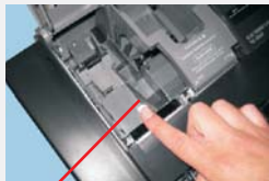
BATTERY COMPARTMENT COVER

Remove the printer cover and open the platen arm (receipt side).